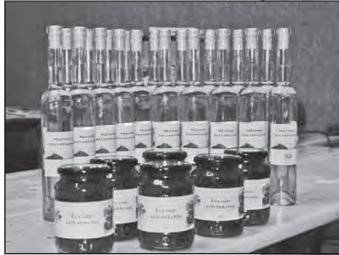
Local products (p alinka (brandy) from the region Hegyk oz and plum jam).

Within a certain region, especially regional and local products, like tourism programs, events or handicraft products, homemade or processed food (jam, squash, walnut, etc.) produced regionally or sold in “organic stores” can be labeled as products of the nature park, which can be a quality guarantee regarding their organic nature. This guarantee can be reinforced by using a „ Nature Park Label ” as a marketing tool (local product).