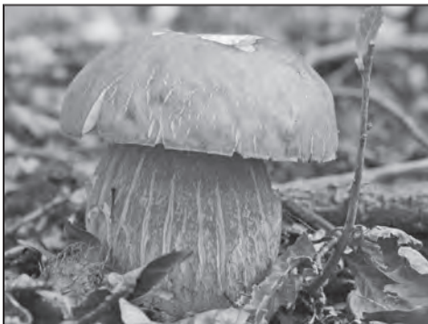
Porcino or penny bun (Boletus edulis).

On the Hungarian side, the Zempléni Helyi Termék és Szolgáltatás Klaszter (Local Produce and Service Cluster of Zemplén) has been established to develop products. The aim of the cluster is to produce all possible joint, individual or supplementary goods by