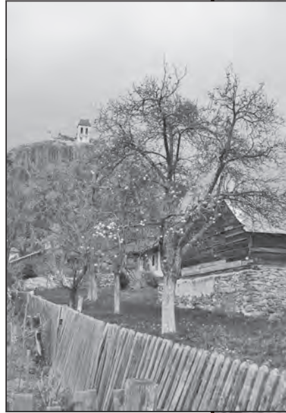
Old apple varieties during autumnal ripeness in Füzér.

The recently launched method based on cutting holes (small canopy openings) is intended to help farmers achieve a forest structure based on